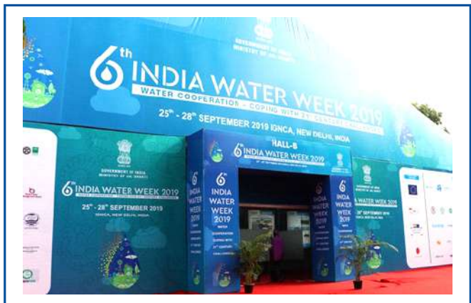
6 th India Water Week 2019

Theme: Water and Energy for Inclusive Growth