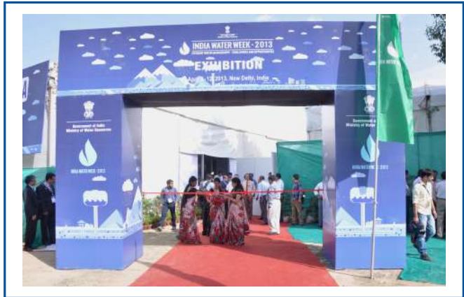
2 nd India Water Week 2013

Theme: Water, Energy and Food Security: Call for Solutions