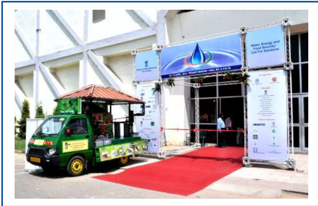
1 st India Water Week 2012

Theme: Water, Energy and Food Security: Call for Solutions