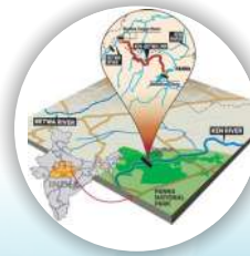
Ken-Betwa link Project