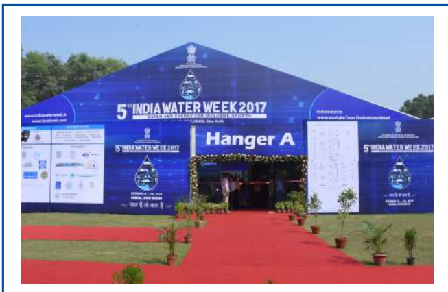
5 th India Water Week 2017

Theme: Water and Energy for Inclusive Growth