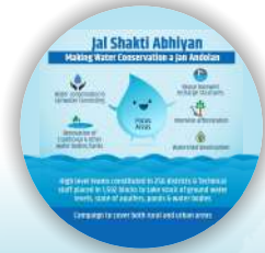
Jal Shakti Abhiyan