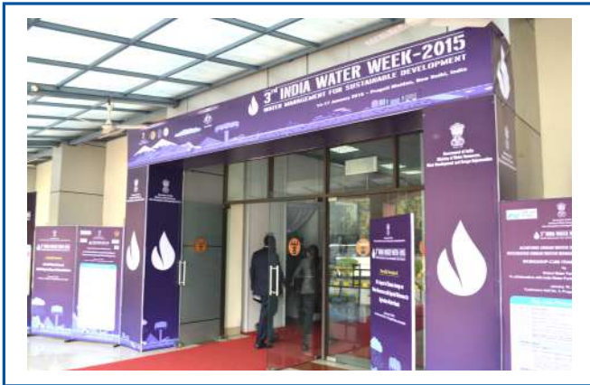
3 rd India Water Week 2015

Theme: Efficient Water Management: Challenges and Opportunities