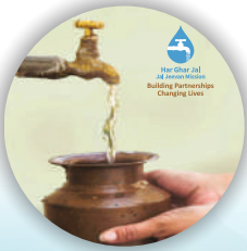
Jal Jeevan Mission