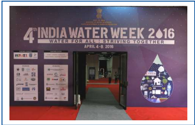
4 th India Water Week 2016

Theme: Water Management for Sustainable Development